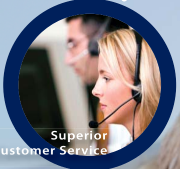
Superior Customer Service